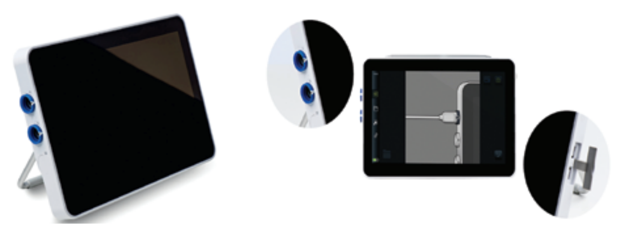
FIGURE 3. Ambu aView 2 Advance.

and oesophago-gastro-duodenoscopes in the department. To maintain these kinds of hardware, our department subsequently paid £45137.00, £20336.40, and £24000.00 per annum for the AERs, dryer and cabinets, and reverse osmosis machines, respectively.