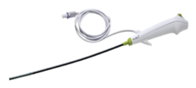
FIGURE 2. Ambu® aScope<sup>TM</sup> 4 Cysto within a sterile packet (Permission granted by Ambu®).

FIGURE 1. Ambu® aScope<sup>TM</sup> 4 Cysto (Permission granted by Ambu®).