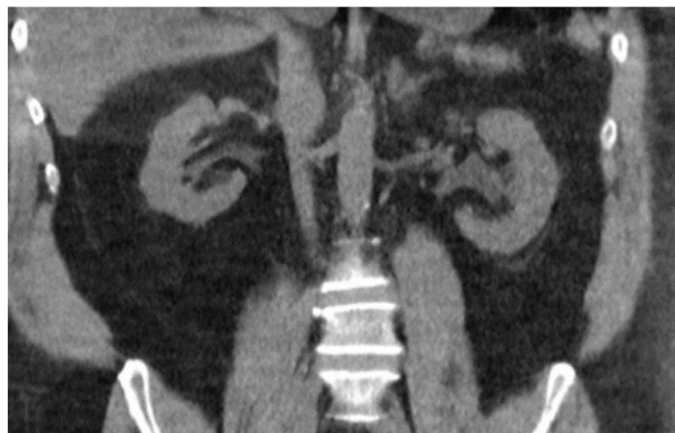
FIGURE 3 Six months postop CTKUB images showing dust-free status.

with PCNL (88–91%) compared to Ureteroscopy monotherapy (59–75%), respectively. In a systematic review, only five studies were identified (mostly case series) regarding the role of Ureteroscopy in the treatment of Staghorn stones. 5 The main advantages of URS monotherapy over PCNL were shorter length of stay, less or no complications as well as the ability to offer modality in borderline fit patients. The main limiting factor of Ureteroscopy in the treatment of staghorn stones has been the inferior stone clearance capacity of URS as compared to PCNL. 6 This obstacle has been overcome in some series of URS monotherapy by active washout of stone dust/small fragments through ureteric access sheath as previously described. 1